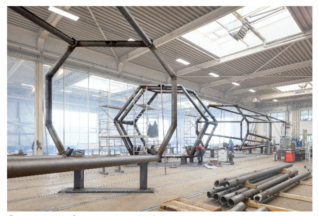
Steelwork fabrication in Plzeň