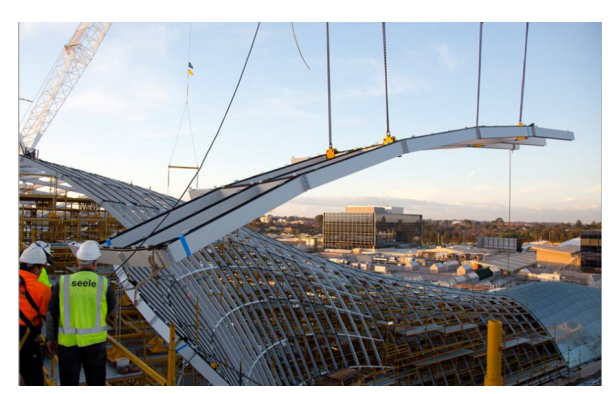
Precision steelwork fabricated by seele pilsen being lifted into place with millimetre accuracy on the Chadstone Shopping Centre site @ seele