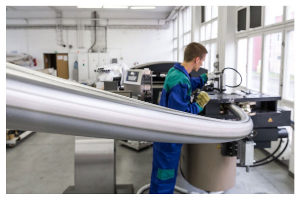
3D tube-bending machine processing stainless steel tubes for the King Abdulaziz Center for World Culture