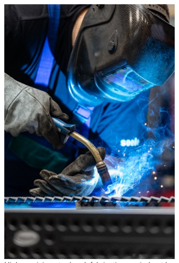
\label{thm:high-precision} \mbox{High-precision steelwork fabrication carried out by experienced personnel @ \mbox{HG Esch} \\