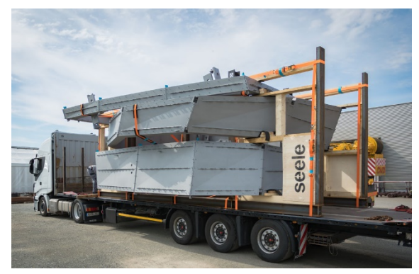
Steelwork components dispatched for on-time deliveries @ seele