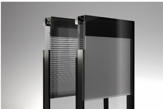
Caption: ISOshade® is an insulating glass unit with a factory integrated sun protection system (venetian blind or vertical blind).