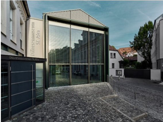
Caption: A total of three ISOshade® elements with heights of almost 7m form the ISOshade® façade of the St. Afra Diocesan Museum in Augsburg, Germany.