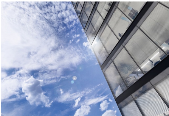
Caption: The ISOshade® façade is a closed double-skin façade that function is based on building physics principles.