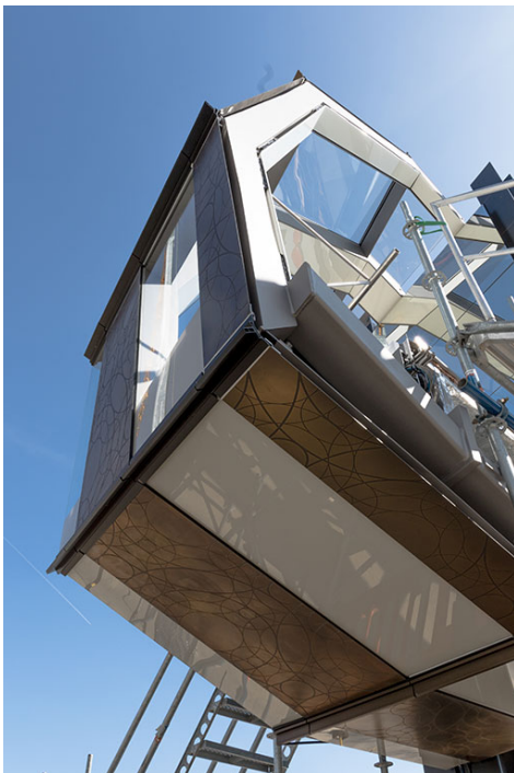
Caption: Mock-up in the form of a 3m long segment, halved vertically, at seele's own testing grounds in Gersthofen, Germany.