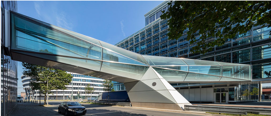
Caption: The captivating elegance of the 35m long steel-and-glass Capricorn Bridge.