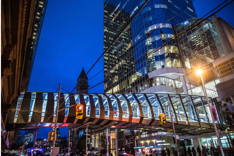
Caption: The CF TEC Bridge crosses Queen Street West to connect the Hudson's Bay Shopping Mall to the Toronto Eaton Centre (TEC).