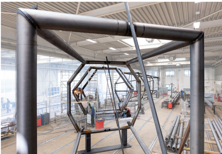
Caption: The steel frames that give the Capricorn Bridge its shape.